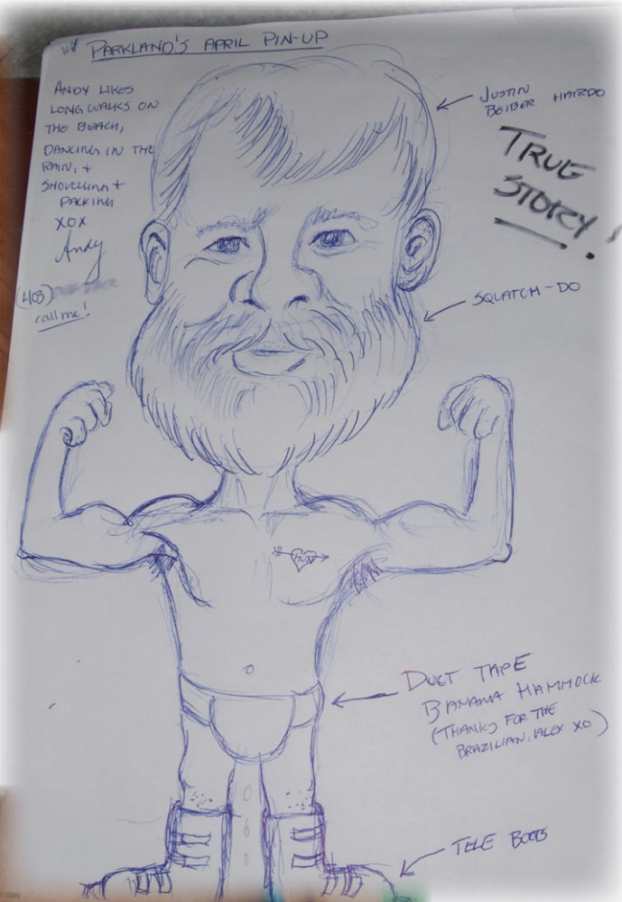
Right & Below: A few of the entries for the Guest Book Doodling Competition