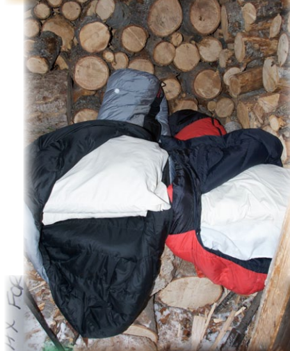
Left: Loud Drinkers deluxe accommodations