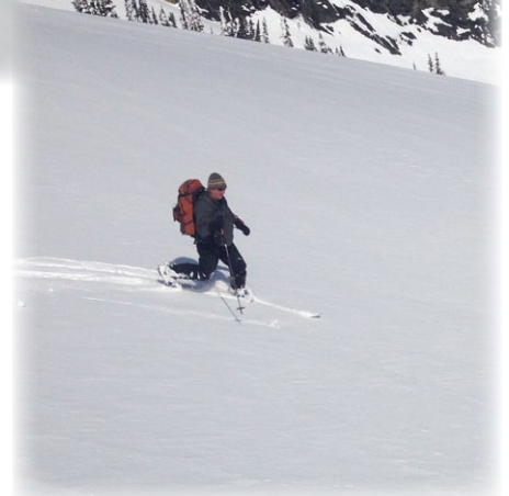
Right: STD putting in some turns on Pollox