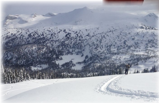
Left: Derry climbing the skin track with Caribou Ridge and Blanket Peak in the background