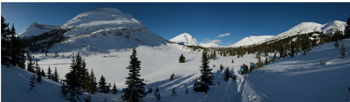
Panoramic photo of Nigel Pass from a previous tour in 2009