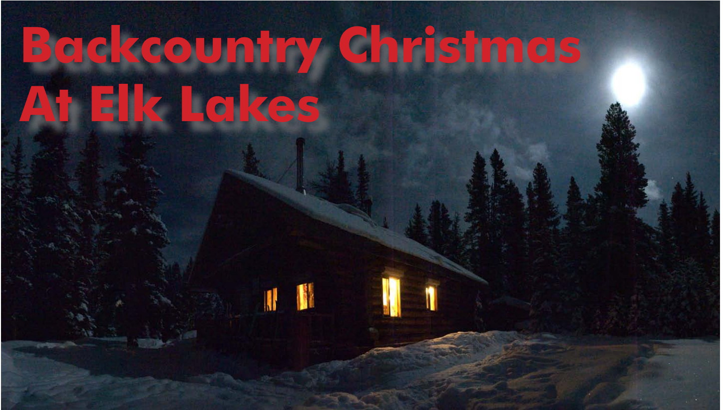
The Moon rises over Elk Lakes Cabin as our hearty skiers patiently wait inside for Santa's arrival